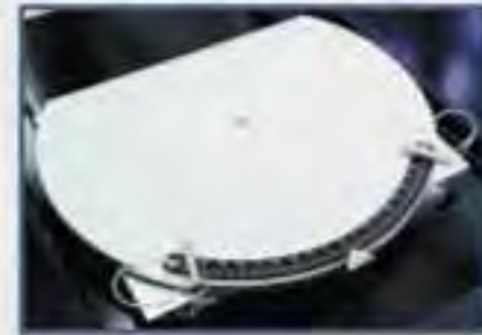
30-TT200: A Pair of Heavy Duty Turning Radius Plates.