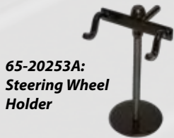
65-20253A: Steering Wheel Holder