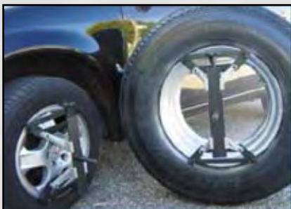
65-9001: Rim Clamps extension kits increase your clamping capacity to 24.5 inches. (Standard for 6000 Series only.)