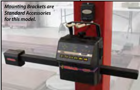
Mounting Brackets are Standard Accessories for this model.