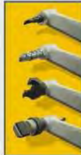
New Multiple Rim Finger Hooks!